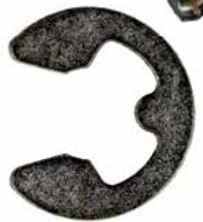
Quarter Window Latch & Speedometer Cable, Retaining Clip. Item # 375-578