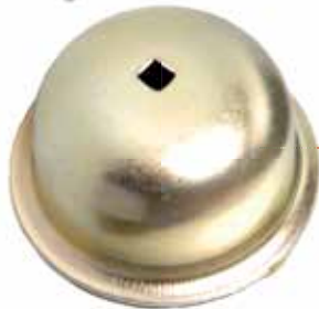
Front LH Wheel Bearing Cap with Hole. Item # 396-184