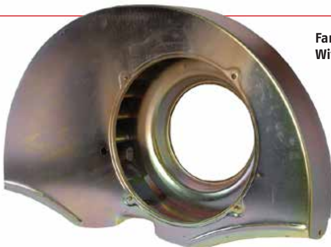
Fan Shroud, Paintable Without Heater Ducts. Item #300-459

Many drivers new to classic air-cooled VW engines are not aware that the crankshaft drives the fan belt which in turn drives not only the