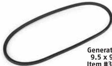
Generator Belt, 9.5 x 905mm. Item #355-085

Oil and air are the primary cooling means for you VW Bug's Engine . When it comes to providing air to the cylinders, the generator/alternator and cooling system are driven by the fan belt. Due to the power absorbed by these two units, the fan belt is subjected to considerable stress, especially at high speed and when shifting down. It is of utmost importance to maintain the belt at the correct tension, if the belt is too slack, it will slip and lead to an overheating of the engine. Excessive tension creates undue stress and is liable to cause breakage of the belt and damage to the pulley or alternator/ generator bearings. While you are checking this, also look for frayed ends or cracks in the belt and replace if necessary.