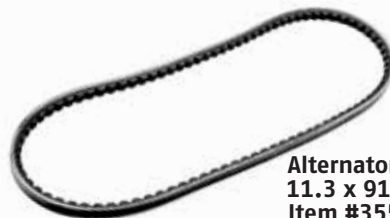
Alternator Belt, 11.3 x 912mm. Item #355-086

You should feel the belt also to check the surface for nicks or other evident damage or wear not detectable with a visual inspection. Visually check the alignment of the pulleys and correct any misalignment via shims or spacers. Some belt failures can be a direct result of oil contamination due to