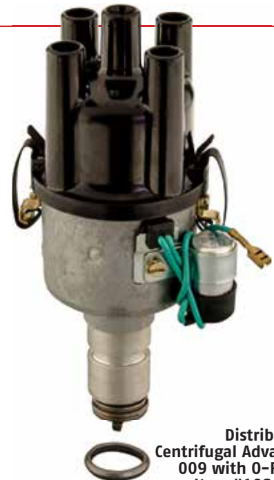
Distributor, Centrifugal Advance, 009 with O-Ring. Item #108-041

It is recommended to check your V-Belt at least every 5000 miles. To test the belt for proper tension, press firmly on the belt with your thumb and measure this distance. The belt must yield approximately 15mm or .6 inches. It is best to crank the engine over a few revolutions or start it momentarily before checking the tension anytime you have made changes to the pulley shims. Doing this will make sure the belt is seated properly in the V-groove rather than possibly being pinched during installation. Also check your belt tension again after the first 100 miles whenever a new belt has been installed.