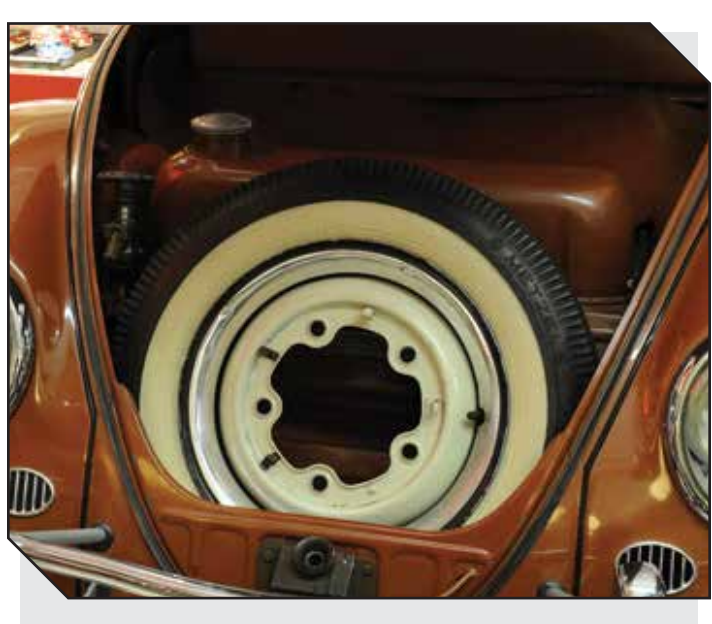
Upright Spare Tire = Standard

Easy way to tell if your Bug is a Standard or Super Beetle: