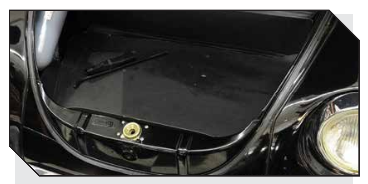
Spare laying flat under Trunk Liner = Super Beetle