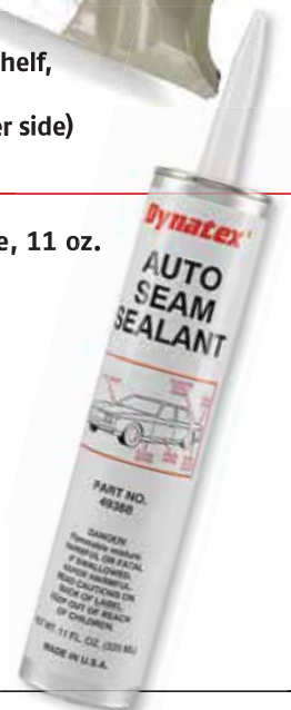
Auto Seam Sealant Tube, 11 oz. Item # 106-016