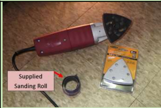
Supplied Sanding Roll

The small roll of coarse sandpaper is provided to roughen up the skid pad surface. In a video describing the installation they indicate it will remove most of the paint. I also used an oscillating multi-tool, as shown here. It is an inexpensive one from Harbor Freight that I have found it to very useful for many tasks. I bought some coarse sand paper designed for removing paint from a surface (I used 60 grit.) It made quick work of removing most of the paint! Hand finished some hard to reach areas with the sandpaper roll supplied in the kit.