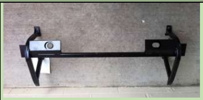
Photo right is a bottom view of what GM refers to as a “radiator support” for a C7 (also called a skid pad) that bolts into the frame below the radiator. It is the low point after the flexible air dam. Unlike the air dam it is not designed to move! This picture is from eBay where it can be purchased for $195.

This is a picture the manufacturer sent me when they were in stock, as I had inquired about when it would be available even before I received the Corvette in early October! You can see that this 1/8 inch thick HD plastic fits over the low portion of the skid pad. Unlike aluminum, the plastic has a low friction surface. On their web site, www.saccitycorvette.com they show a Corvette moving and sliding up and over a cement parking stop! For the C7 they are selling the glued version versus both it and the screw-on type they also sell for older Vettes. After reviewing their video, I thought the glued-on approach would be fine.