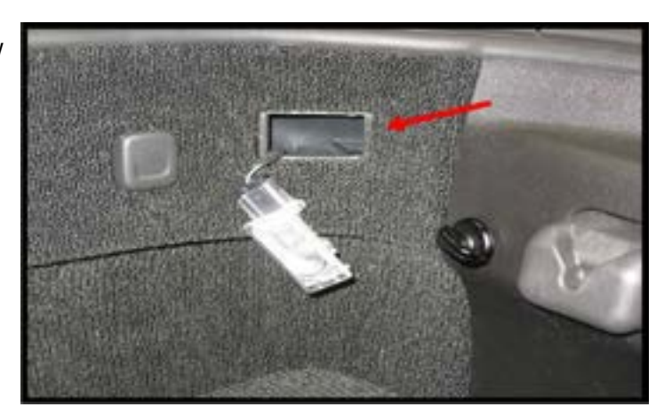
Step 5. Using something non metallic (a pencil works best) push the factory bulb out of its contacts. It will be hot so don't let it burn your carpet or your fingers!

Step 4. The rear hatch/trunk light housing can be easily removed by prying it out of the panel. Pull out at the red arrow.