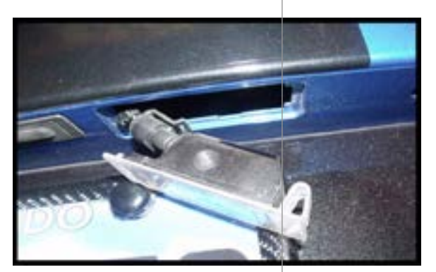
Step 3. Remove factory bulb. Be careful, it will be hot! Turn on the lights. Insert LED bulb. If it doesn't light, turn it 180 degrees and re-install. Reverse this procedure to re-install light.