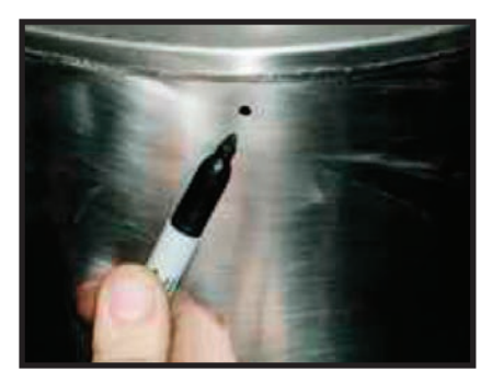
NOTE: IMPORTANT - Make sure that the small drain or weep hole in rear of muffler faces down when muffler is installed

NOTE: During cold weather start-ups, you may experience an exhaust sound that is deeper and louder in tone than usual. This is temporary and will diminish to normal once your engine has reached its normal operating temperature.