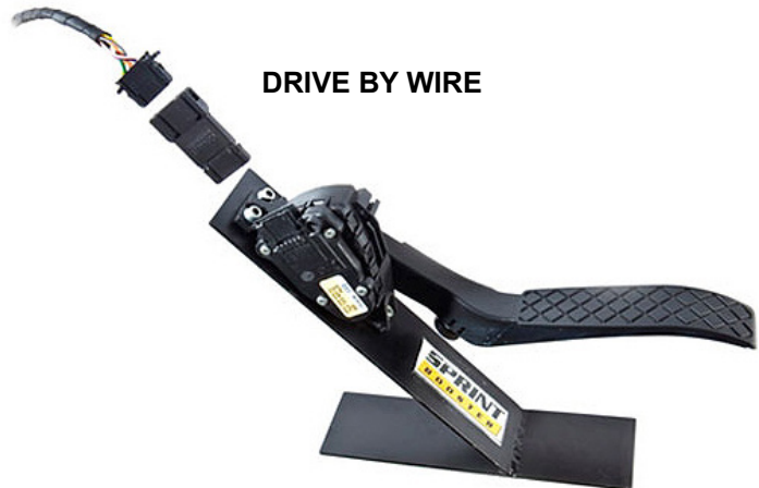
DRIVE BY WIRE