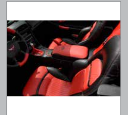
Restored C5 Seats