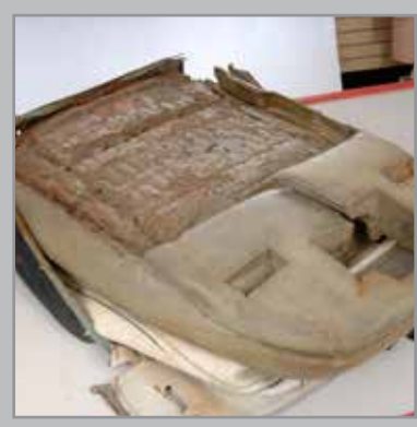
An Old C4 Seat