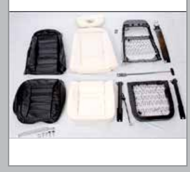
C4 Seat Restoration Kit

The best combination of great looks and real leather feel, paired with rugged durability.