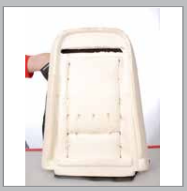
C4 Seat Foam