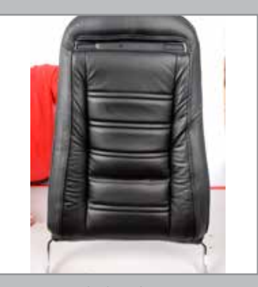
C4 Seat Cover