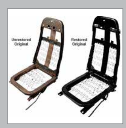
C3 Seat Frame

C4: The C4 Corvette sport seats came with controls on the side of the seat that are surrounded by a bezel. Those bezels are inexpensive to replace and can be a quick and easy improvement to the appearance of your seats. Remember, when doing a seat evaluation, check the hoses, gears and cables for damage.