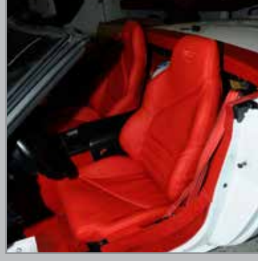
Restored C4 Seats