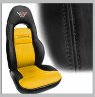
C5 Sports Seat

*Mid America Motorworks Corvette Swatch Program. Time and sun exposure can cause your interior to fade. Be sure of your Corvette's true interior color by requesting a FREE color swatch! - 877.639.2844