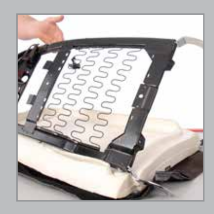
Placing the C4 Seat Bracket