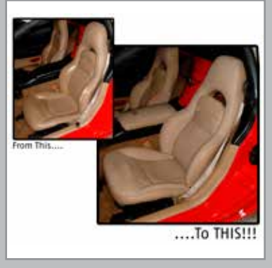
C5 Seat Before & After

Seat restoration is only the beginning. This is also a great time to replace carpet, add accent interior pieces and give your entire interior a whole new look. Call 800.428.2200 for more details