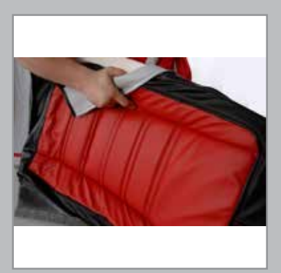
C3 Seat Restoration